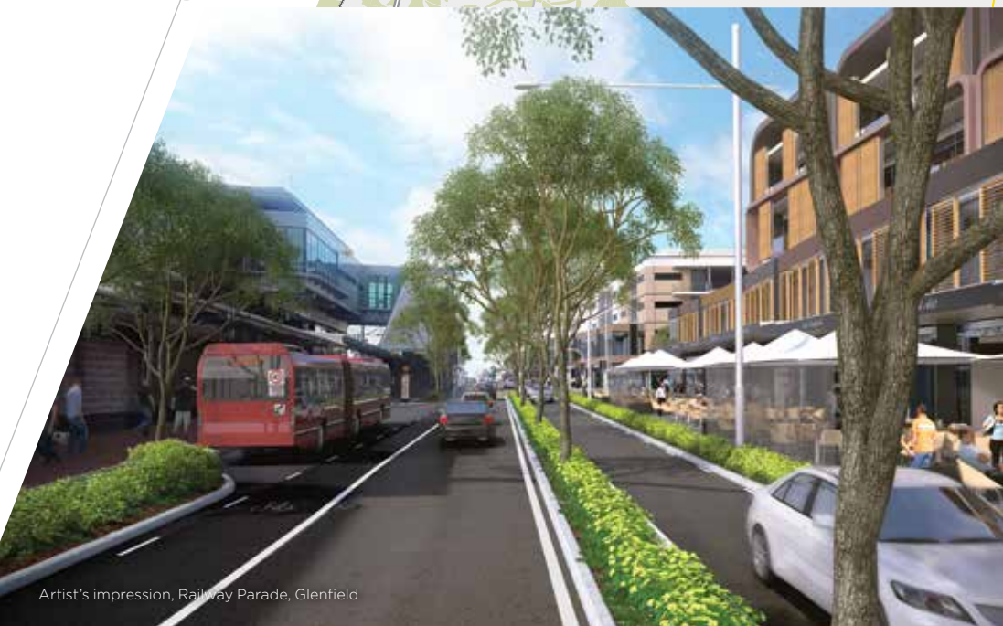
Artist's impression, Railway Parade, Glenfield