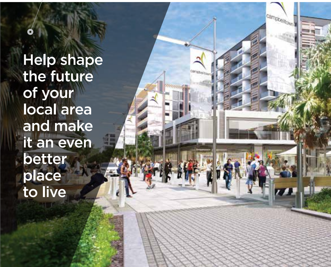
Artist's impression of Queen Street - Campbelltown

Help shape the future of your local area and make it an even better place to live